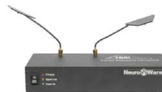
TBSI 15 Ch Wireless Neural Headstage Receiver