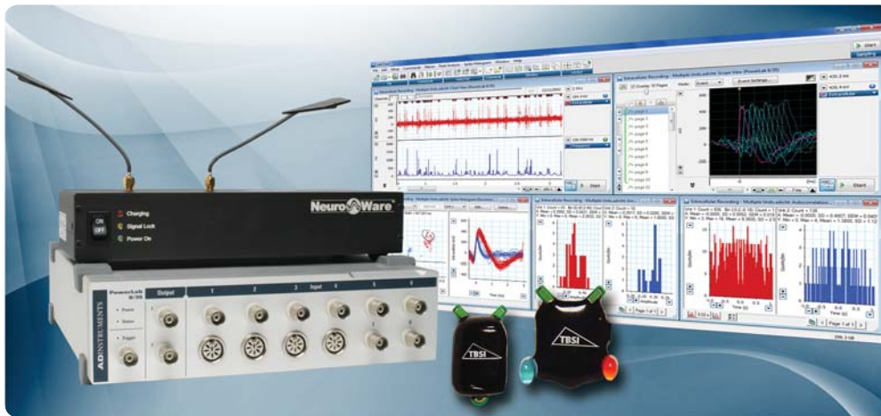
The complete TBSI Wireless Neural Recording Systems feature the PowerLab data acquisition unit, industry-leading TBSI Headstage Transmitter & Headstage Receiver, as well as the powerful & flexible LabChart software.

ADInstruments and Triangle BioSystems Inc. (TBSI) give researchers a way to fast track their behavioral-electrophysiological studies with industry-leading systems for wireless acquisition of neural data. The systems are ideal for rodent studies that require high degrees of movement freedom as well as accurate and precise multichannel spike data.